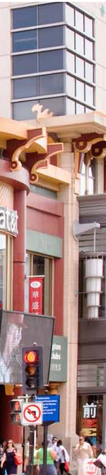
Chinatown Metro with 27,000 Riders per Day